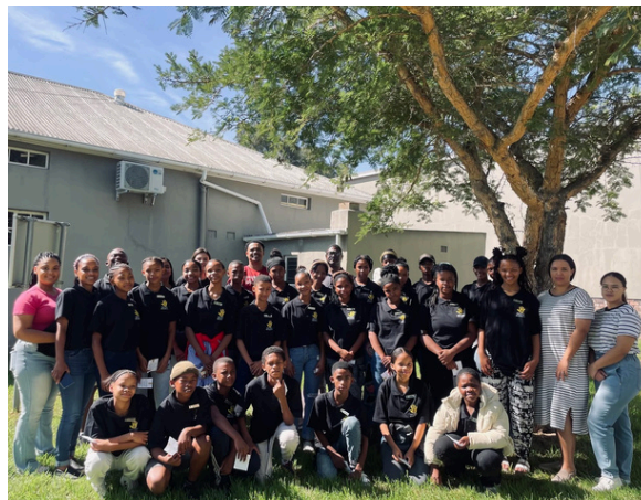
The Pebbles Ambassadors for 2025