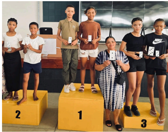
Inter-Centre Dominoes Tournament in Citrusdal