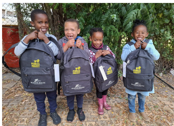
Happy faces with their Pebbles School Packs.