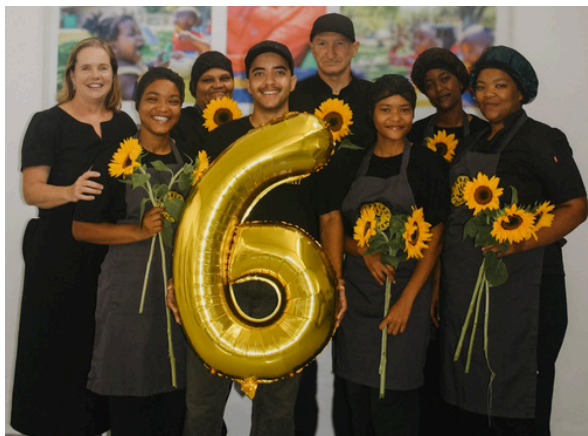
The amazing Pebbles Kitchen team celebrating an incredible milestone.